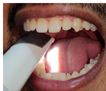
Fig. 1: shows using of a digital scanner to take a digital impression and create and place a crown or full-coverage restoration

scanning of oral structures, capturing them as 3D data, which is then converted into polygonal information to create a digital image. Alternatively, an extraoral scanner may be used for indirect scanning, where patterns are digitized outside the mouth [Yoshimasa Takeuchi et al. , 2018]. The success of the procedure depends on the skill and experience of the operator using the scanner, as well as the condition of the area being scanned, which must be free of obstructions like blood, saliva, or soft tissues (Seelbach P et al. , 2013).