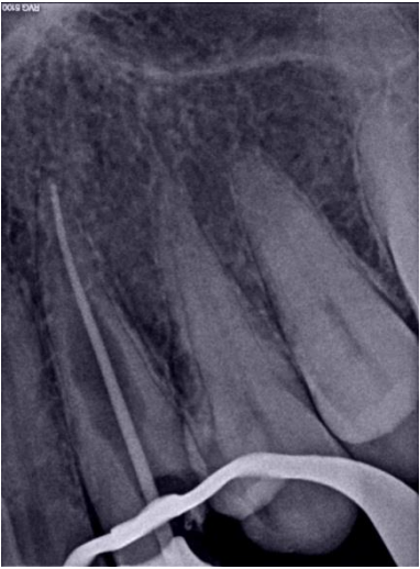
Fig-3:- Master Cone