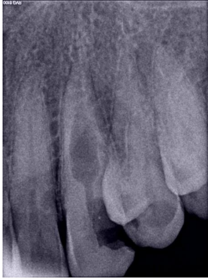
Fig-1:- Pre Operative

MORITA) and radiographs (Figure 2). The root canal system was debrided thoroughly and prepared by the step-back technique to a size 40. Copious irrigation with 2.6% sodium hypochlorite solution was used throughout the procedure. The absence of a perforation in the defect was confirmed by paper points (absence of bleeding) and the use of an apex locator. Calcium hydroxide paste was placed in the canal for a week, to alkalinize the environment. After 7 days, calcium hydroxide dressing was removed. The canal was finally irrigated with chlorhexidine and dried. Apical to defect root canal was obturated with guttapercha cones (Figure 4) and defect was filled with MTA (Figure 5). The next day remaining root canal space was obturated with guttapercha cones (Figure 6) and follow up was planned after 6 months and 1 year (figure 7,8).