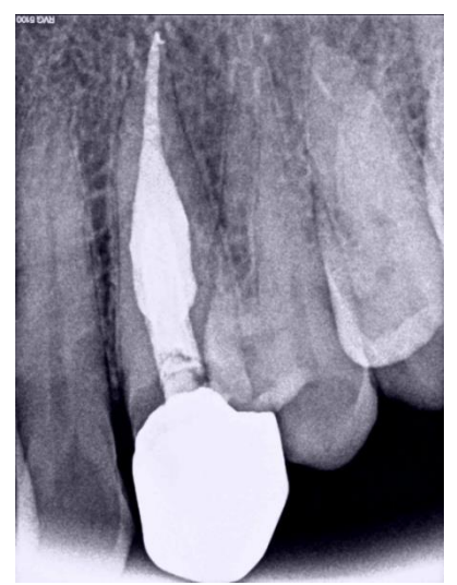
Fig-8:- Follow Up After 1 Year