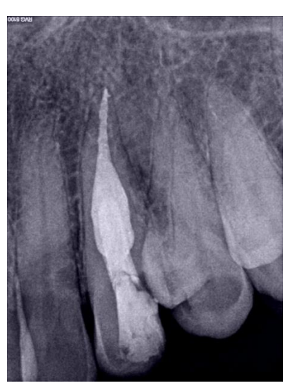
Fig-7:- Follow Up After 6 Months