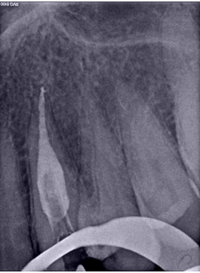
Fig-5:- MTA Placeed In The Defect