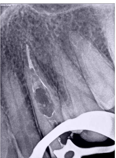
Fig-4:- After Obturation Apical To Defect