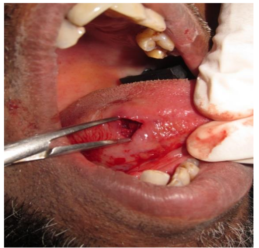
Fig 3: Foreign body being removed surgically under local anesthesia

Fig 2:Intra oral periapical radiograph with white arrow indicating swelling of tongue & black arrow indicating linear radio opaque foreign body in the substance of tongue