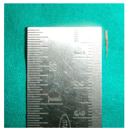
Fig 4:Fish bone, approximately 1cm long, was located and retrieved under local anesthesia