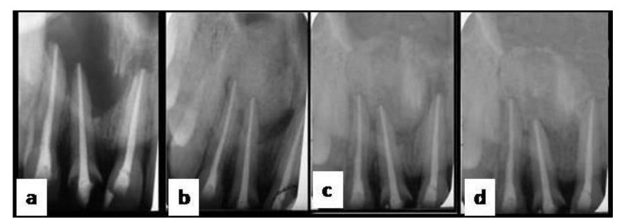
Fig. 3: (a) lesion after root canals obturation. (b) Immediate postoperative radiograph after PRF and hydroxyapatite mixture placement, (c) 3months followup, (d) 6 months followup