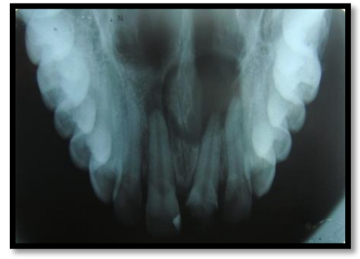
Fig. 1: Preoparative radiograph

Commercially available hydroxyapatite bone graft crystals (Biograft HA, IFGL Bioceramics Ltd., India) were sprinkled over the PRF gel and together the mixture was placed into the defect site (figure 2d). Flapstabilization was done followed by suturing using 3-0 black silk suture material (figure 2e), and postoperative instructions were given. Patient was kept under the antibiotic coverage along with 0.2% chlorhexidine gluconate mouth rinses for a period of 5 days. Suture removal was done after 5 days. Patient was reviewed after 3 months (figure 3c) and 6 months (figure 3d) during which there were no symptoms of pain, inflammation, or discomfort. Six month recall radiograph revealed a dense radiopacity, intact lamina dura and trebeculae in regular fashion at periapical area of # 11,12 and 21.