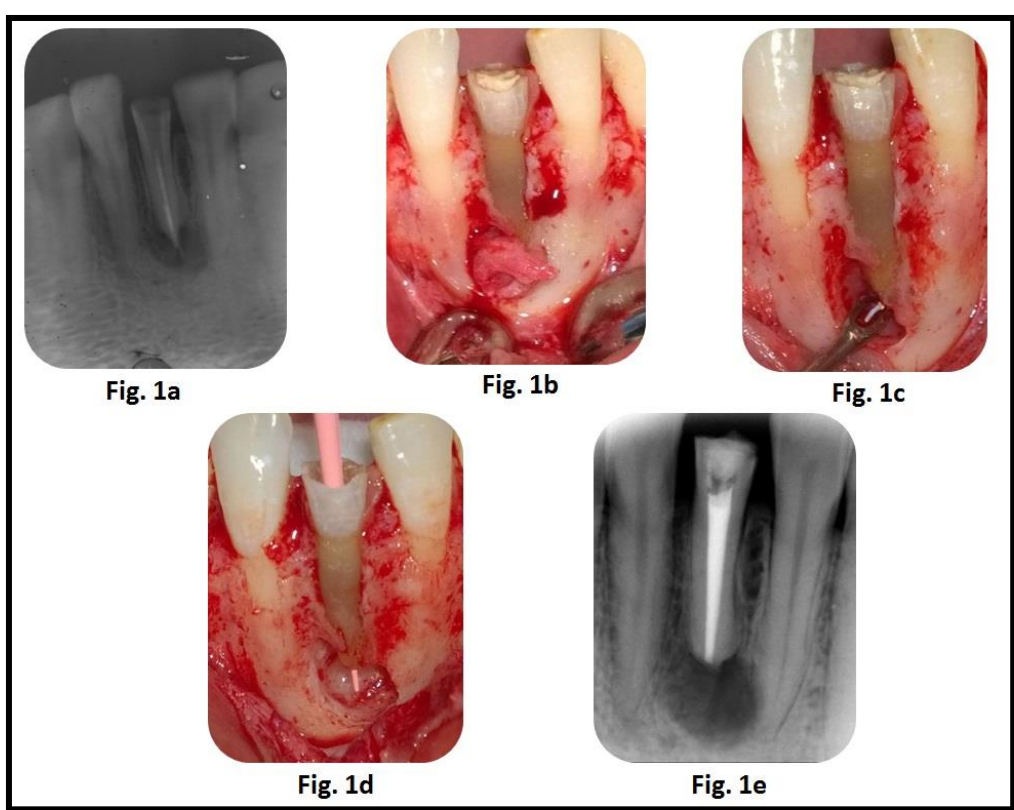
Fig-1: (1a)- Pre-operative IOPAR of 31 showing over-extended obturation (1b)- Granulation tissue is seen after reflection of the flap (1c)- Extruded gutta-percha being retrieved (1d)-Largest cone that can pass through the resected root end (1e)-Post-obturation IOPAR of 31

This patient reported with a chief complaint of pain in relation to his lower front teeth region since one month and history of root canal treatment in relation to 31, one year back. On clinical examination, 31 was found to be discolored and was tender on percussion. Radiographic examination revealed over-extended obturation in relation to the same tooth along with a periapical lesion (Fig. 1a). The extruded gutta-percha could not be retrieved with orthograde approach and minimal persistent discharge was observed every time the root canal was opened. Periapical surgery with midsurgical endodontics was planned to retrieve the extruded gutta-percha (Fig. 1b to 1e). The patient was asymptomatic during the follow-up period (3 months).