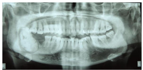
Fig 2: Pre op OPG

The panoramic radiograph revealed a large irregular radiopaque mass extending distal to first molar upto the retro molar region posteriorly and superiorly it extended beyond alveolar crest (fig.2). The lesion was surrounded by a distinct radiolucent rim. Written inform consent was obtained from the patient. The surgical procedure was carried out under GA. The lesion was treated by surgical enucleation. A linear incision extending from the distal surface of the first molar upto the anterior border of ramus was placed and a mucoperiosteal flap reflected (fig.3). The bone overlying the lesion was removed and the lesion was curetted out in toto (fig.6). The lesion measured approximately 4.5x2.5 cm and was associated with a tooth (fig.4&5). The anatomy of the tooth was similar to lower third molar. Curettage was done carefully to avoid pathological fracture of the mandible and damage to the inferior alveolar and lingual nerve. Deepithellialization of fistula was done in the cheek region and submandibular region. Primary closure was done intraorally using 3-0 vicryl and extra orally using 3-0 prolene. Histopathology report confirmed the lesion to be a complex odontoma.