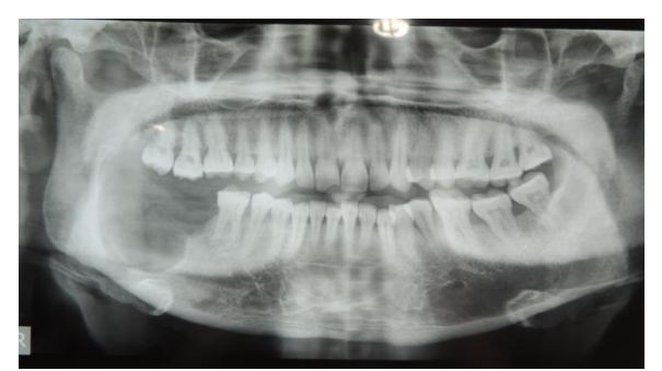
Fig 6: Post op OPG