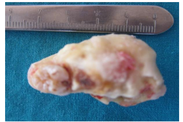
Fig 4: Lesion in toto