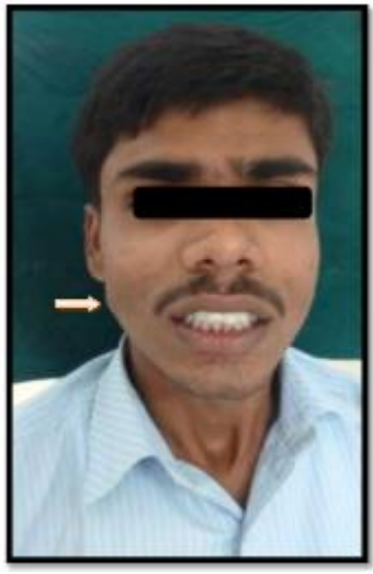
Fig-2: Swelling evident on contraction of masseter muscle i.e, "Turkey Wattle" sign