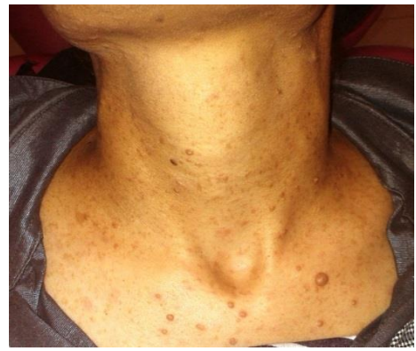
Fig-1: Multiple cutaneous nodules of different sizes.