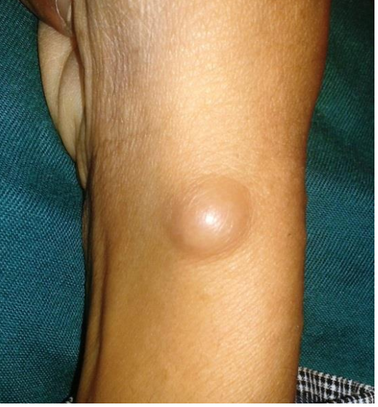
Fig-2: Subcutaneous neurofibroma