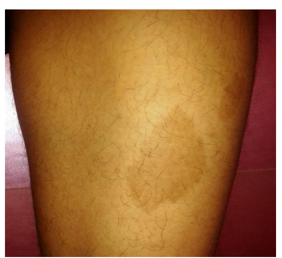
Fig-3: Café-au-lait spots on the legs