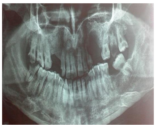
Fig-5: Circular radiolucent bone lesion, lysis of the root of the maxillary canine bordering the lesion, multiple penetrating caries with periapical granulomas. Note the presence of widened inferior alveolar canal with enlarged right and left mental foramina.