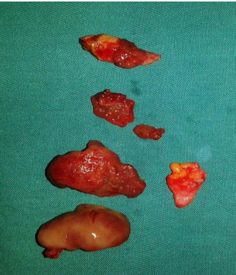
Fig-8: Specimens and extracted canine.