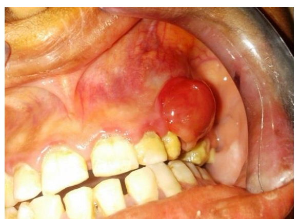
Fig-4: An inflamed lesion with distinct border surmounted by a bony swelling with firm consistency