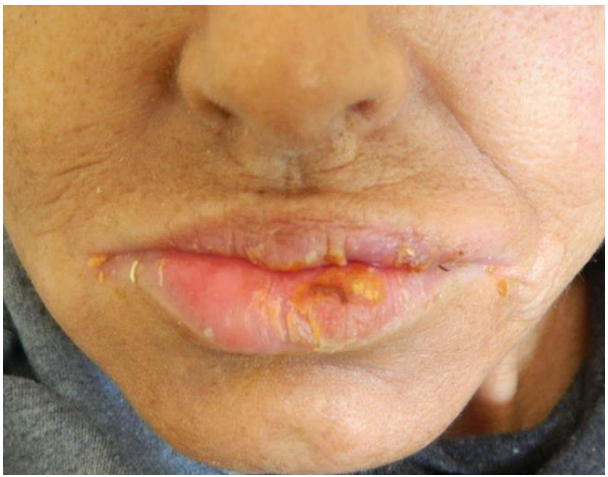
Fig-4: Healing of the lesions within ten days

The incisional biopsy on the perilesional mucosa was done, and the histopathological features has shown an acanthotic squamous epithelium with few necrotic keratinocytes and many lymphocytes exocytosis associated with focal spongiosis. The