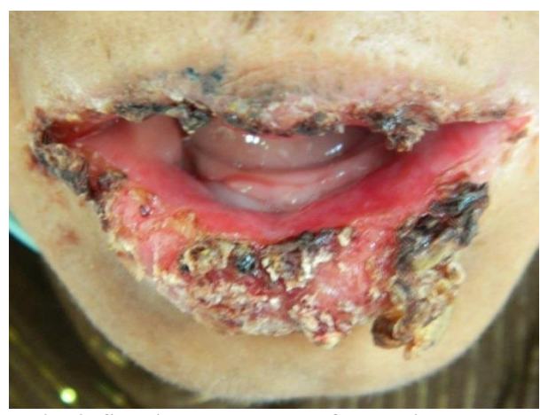
Fig-2: Swelling and redness of the labial mucosa

Management include removal the labial crust under local anesthesia with oxygenated water to facilitate healing of the lesions and prescription of strong dermocorticoid cream ( Dermocort 0.05%) three times daily, along with local anesthetic gel (xylogel