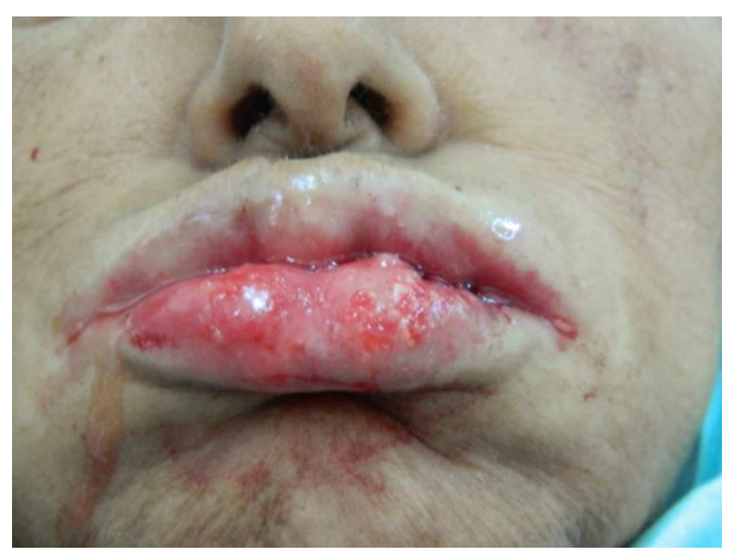
Fig-3: Clinical aspect after crust removal

2%) to decrease pain and allow alimentation (Figure 3). Furthermore, the patient was advised soft, bland diet. The patient responded dramatically to the treatment and the labial lesions almost resolved within 10 days on the follow-up (Figure 4).