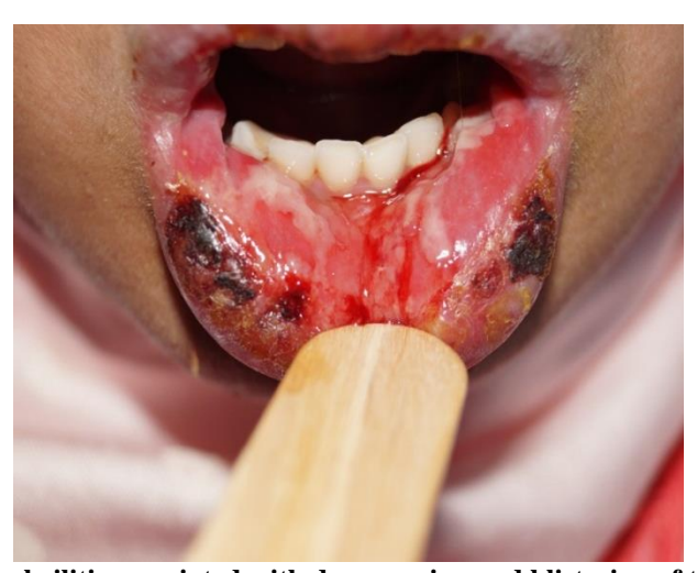
Fig-7: Crusty\ cheilitis\ associated\ with\ deep\ erosion\ and\ blistering\ of\ the\ lip\ mucosa

A 30 years old female was referred by her general dentist after the onset of deep erosion and crusty lesions of the lips appeared three days ago (Figure 7). Her medical history was unremarkable and the patient didn't report any drug intake during the last two weeks or recent infection. The patient reported a similar anterior attacks three months ago that resolved spontaneously. The diagnosis of erythema multiforme was made based on the clinical aspect, the acute onset and the recurrent aspect of the disease. To comfirm the diagnosis, an incisional biopsy was done and has shown the histopathological feature of erythema and negative direct immunofluorescence.