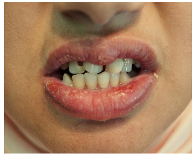
Fig-8: Lesions almost healed on the seventh day follow-up

prednisone at a posology of 1mg/Kg/day for 7 days. Serological investigation for HSV-1 and HSV-2 was negative. The lesions were almost healed on the seventh day follow-up (Figure 8).