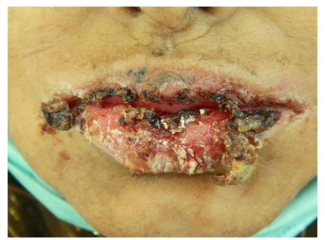
Fig-1: Crusty cheilitis of the labial mucosa