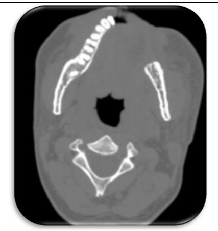
Fig-4: Axial computed tomography bone window: hyodense lesion and perforation of the buccal and lingual cortical plates