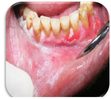
Fig-2b: leukoplakic lesion accentuated in the right side