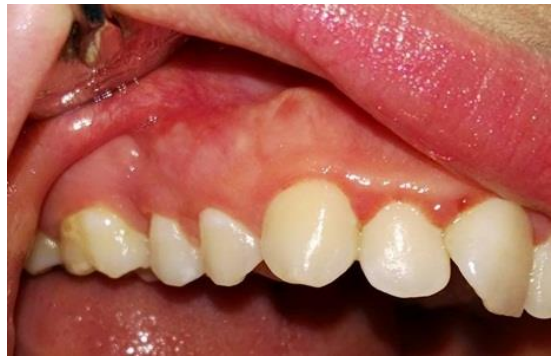
Fig-5: At 9 months: Complete mucosal healing with no clinical signs of recurrence

and periapical radiographs (Figure-6a and b) follow up after 9months show bone restoration in the area of the KCOT.