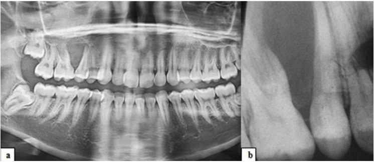
Fig-2: Panoramic (a) and periapical (b) radiograph showing a well-defined unilocular radiolucent image without a cortical border, between the teeth 15 and 16 which are displaced

Fig-1: Fig-1: Intra-oral clinical aspect: swelling of the mucosa in region 15-16 with a purulent discharge through a fistula.