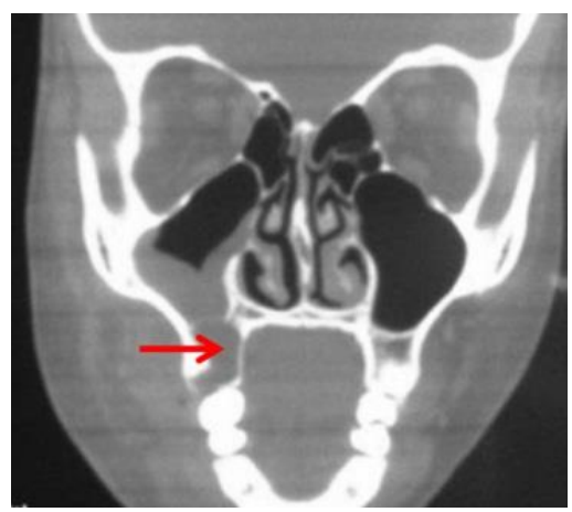
Fig-3: CT scan of the maxilla with bone window (coronal section) showing a hypodense unilocular and welldefined lesion associated with the thinning of the maxillar cortex, the displacement of the maxillary sinus floor and thickening of the sinusal floor mucosa (red arrow)

unilocular lesion well-defined associated with the thinning of the maxillar cortex, the displacement of the maxillary sinus floor and thickening of the sinusal floor mucosa (Figure-3). The CT scan with soft tissue window and contrast agent injection shows the radiologic features of cellulitis: the maxillary abscess with soft tissue thickening and myositis.