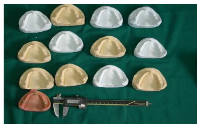
Fig 4: Cast preparation from Alginate, Dual Alginate and Compound impression.