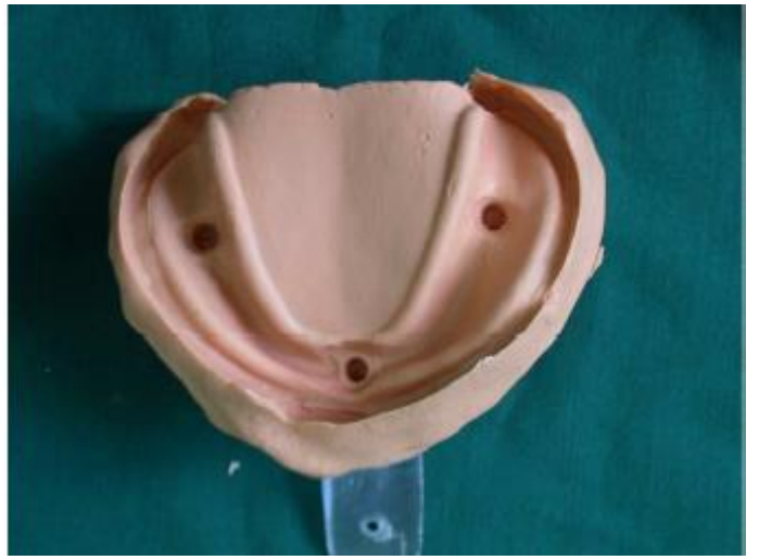
Fig 3: Dual Alginate impression.

a thin layer of alginate was applied into the impression and seated in the same position (Fig 3). In order to maintain the dimensional stability of impression materials, in all three techniques, the steps were carried out in 12 min from the impression making to the cast pouring.