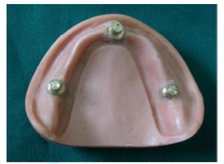
Fig 1: An acrylic resin model of edentulous mandible as the standard cast

An acrylic resin model of edentulous mandible was prepared, where each region of first right and left molars and anterior midline point of the arch, a metal cone was placed (the standard cast) [7]. In each metal cone, a small slot was prepared as the reference point of measurement (Fig 1) [15]. Impressions, in which all the regions and surface details were recorded, were made on the basis of standard cast and in accordance with any impression techniques studied.