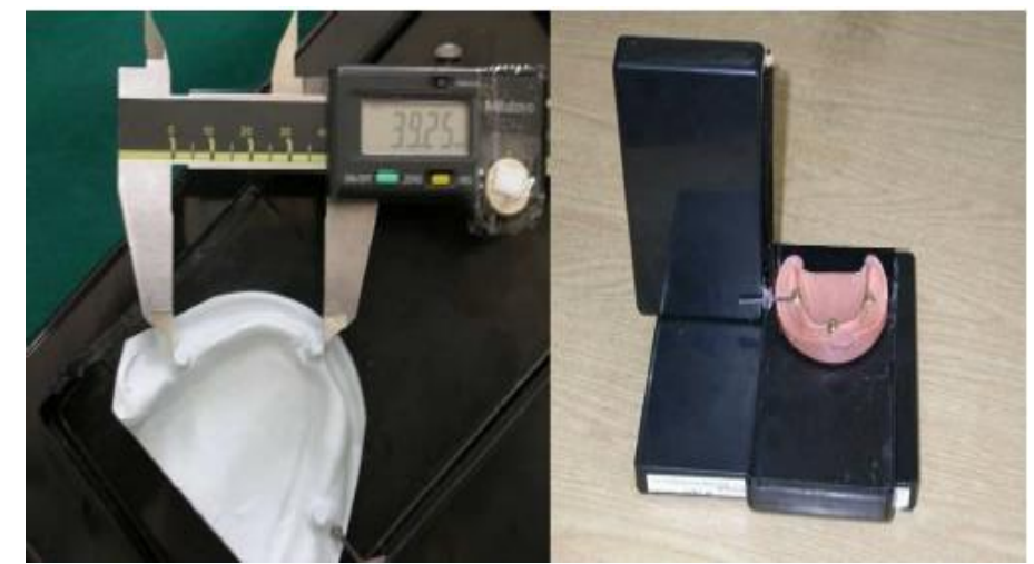
Fig 5: A Screen marker for measuring the length and width of the samples and standard model.

placed on the horizontal plane. The samples and digital caliper were positioned at an inclination of 45^{\circ} to another indicator placed on the horizontal plane [19-21]. In this position, the length of all samples was measured. It seems that this measuring method is the most accurate with the least possible error, considering available resources. In this way, the length and width of the standard cast and other casts were measured three times utilizing a digital caliper (Mitutoyo, England) with an accuracy of 0.01 mm. The means were considered as the dimensions of the casts (Figure 5). Data were statistically analyzed using one sample test and SPSS15 software.