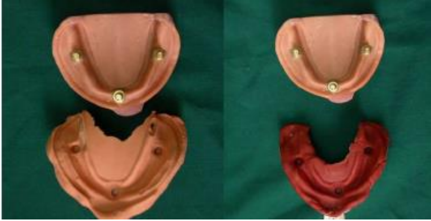
Fig 2: Alginate and red Compound impression making.

in the tray, the impression of the model was made, removed, rinsed under water and surface moisture was removed [17, 18]. Excess materials and undercuts were cut away using scalpel blade (Figs 2).