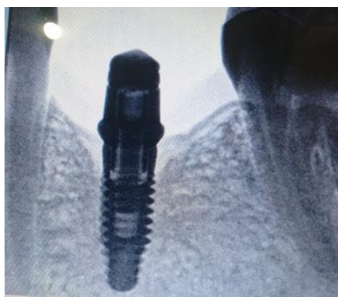
Fig-4: Implant with abutment in place