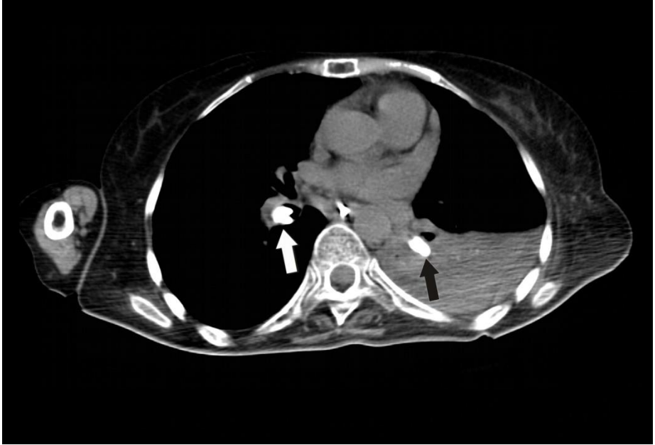
Fig 2: Non contrast CT examination confirmed that there are molar teeth in main bronchi.