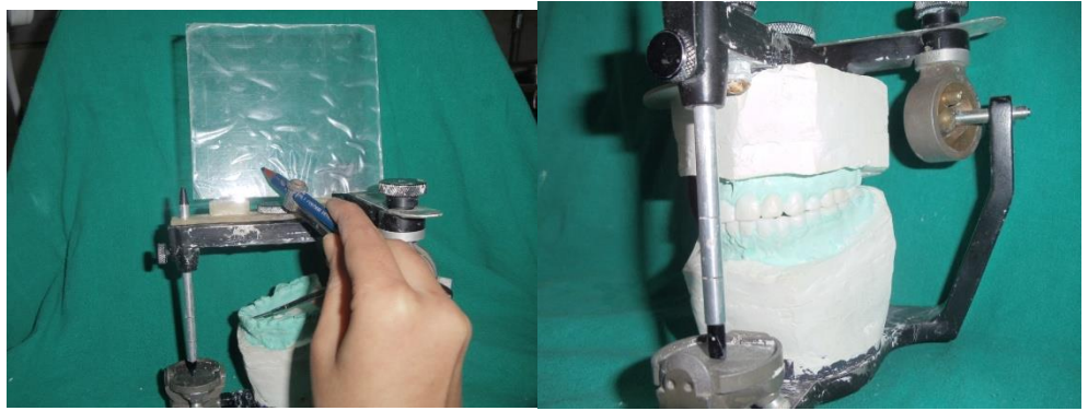
Fig-6: Occlusal plane analysis