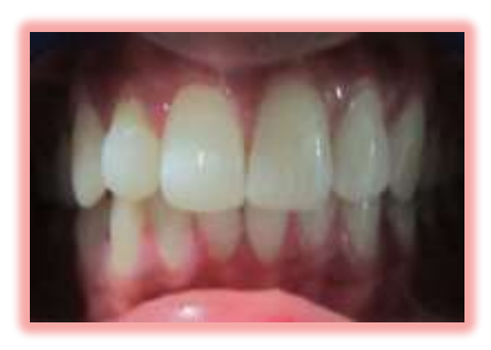
Fig-01: Interdental papilla

The presence or absence of interproximal papilla was done visually. And Papillae were considered present when gingival tissue filled the embrasure space. Measurements were only performed on the sites that had close contacts.