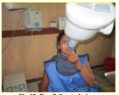
Fig-02: Paralleling technique

technique, using rinn XCP film holder, which was done by the same operator each time.