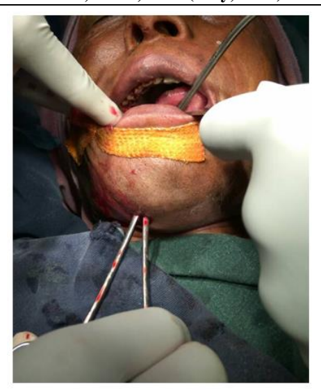
Fig-3: Curved hemostast is introduced extraorally from skin incision site and the lingual mucosa is breached, close to the lingual surface of the mandible