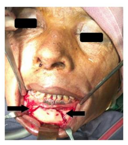
Fig-5: Bilateral parasymphysis fracture