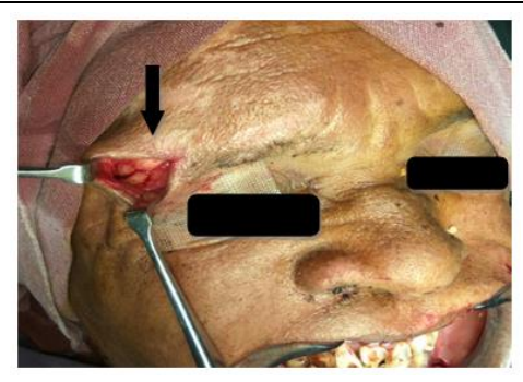
Fig-6: Fracture above the frontozygomatic suture