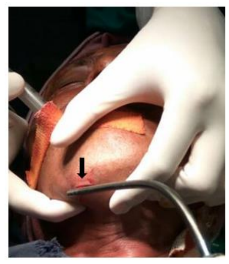
Fig-2: 2 cm incision given on the paramedian to the symphysis region