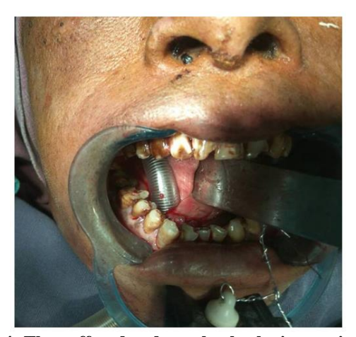
Fig-4: The \ cuff \ and \ endotracheal \ tube \ is \ exteriorised