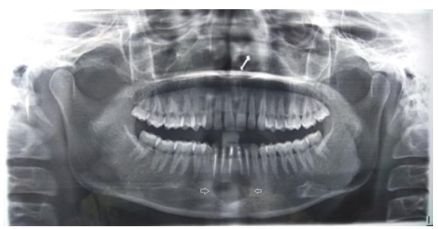
Fig-2: Orthopantomogram of the patient preoperative

was 21 X 12 mm. There was radiopacity noted in the root canals of 33, 32, 31, 41, and 42 suggestive of previous obturation. There was no evidence of any root resorption of any of the involved teeth.