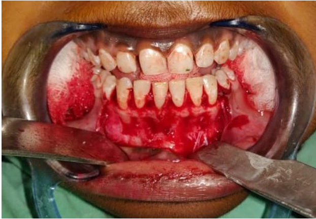
Fig-3: Mucoperiosteal flap reflection

The bony cavity was thoroughly rinsed with normal saline. The teeth 33, 32, 31, 41 and 42 were retrogradely restored with Glass Ionomer Cement. Then about 20 ml of blood was withdrawn and platelet- rich fibrin (PRF) was prepared. The freshly prepared PRF was packed inside the bony cavity, and the mucoperiosteal flap was returned to its original position and primarily closed by sling suturing technique using 3-0 polyglactin suture material.