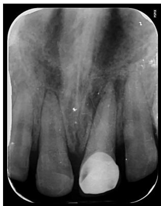
Fig-5: Follow-up after 6 months

Patient was recalled after one week and was completely asymptomatic. Further, the tooth was restored with porcelain fused to metal (PFM) crown. The patient was recalled after 3 months. At 6 months of follow-up,(figure 5) the patient was asymptomatic and periapical radiograph demonstrated satisfactory healing.