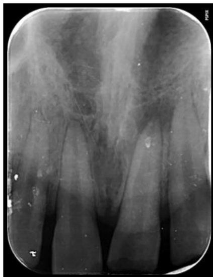
Fig-1: Preoperative radiograph

a periapical lesion and internal resorption in relation to 21 (figure 1). Diagnosis of periapical abscess with internal resorption in relation to 21.