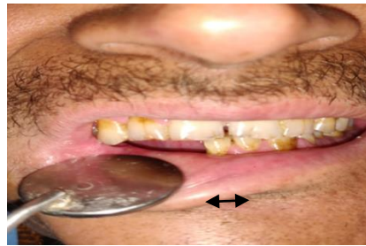
Fig. 4. Deviation correction after palatal ramp appliance therapy