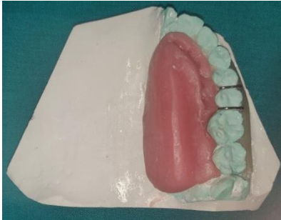
Fig.3. Maxillary partial retainer with pin head clasps and acrylic backing along with the palatal ramp.