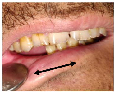
Fig.1. Deviation of mandible towards resected site (approx. 14mm, measured by calculating the mesiodistal width of central and lateral incisor)

the mouth, repolished and inserted. Instructions were given to wear the appliance at all times other than during meals. Stretching exercises were suggested for the patient to manipulate the mandible to the desired position.