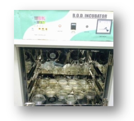
Petridishes Placed Inside Incubator