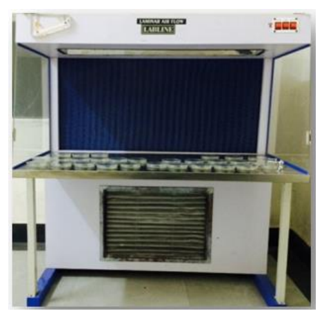
Solidification of Agar Medium in Laminar Air Flow