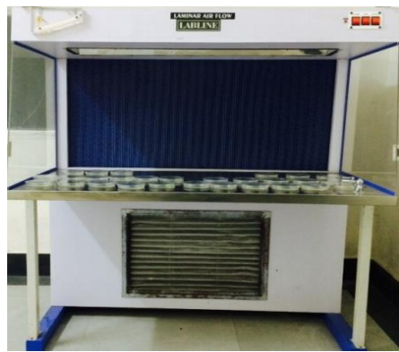
Laminar Air Flow