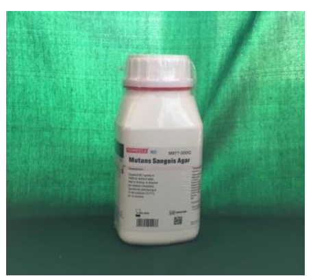
Mutans Sanguis Agar