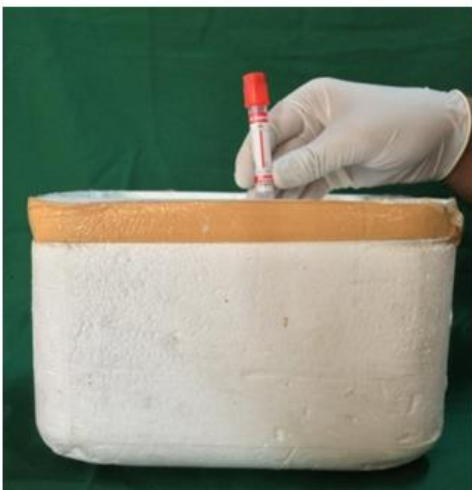
Ice Box Plaque Collection and Transportation