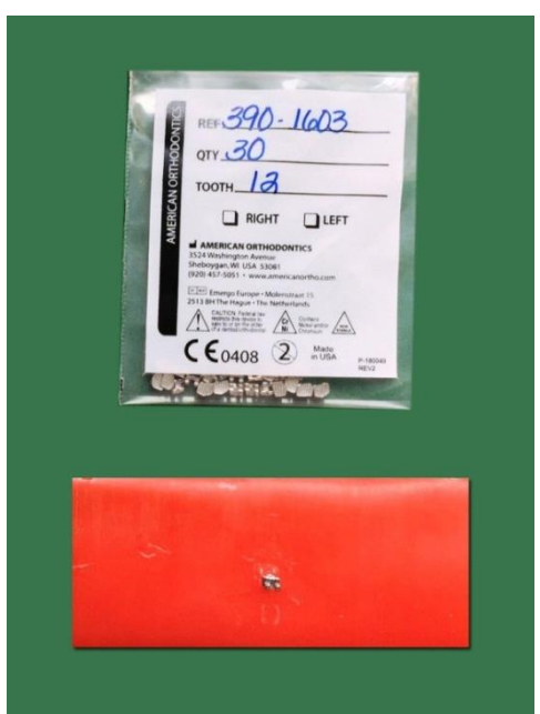
Self ligating Bracket