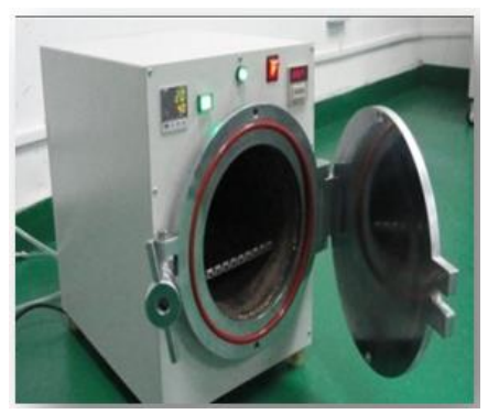
Sterilization of Diluted Agar Medium in Autoclave