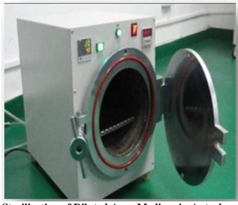
Sterilization of Diluted Agar Medium in Autoclave