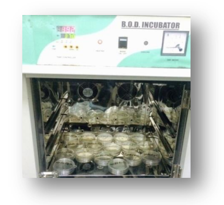
Petridishes Placed Inside Incubator