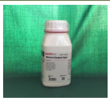
Mutans Sanguis Agar