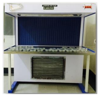
Solidification of Agar Medium in Laminar Air Flow