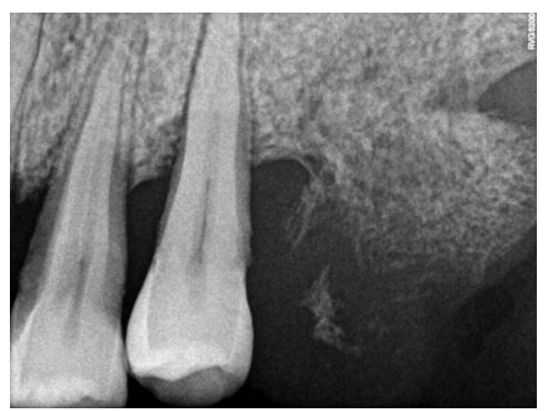
Fig-2: Intraoral radiograph shows ragged loss of bone with peripheral cuffing.

On radiographic examination, the intraoral periapical radiograph showed superficial erosion of the bone with pathognomonic peripheral 'cuffing' (Figure 2). Based on clinical examination, a differential diagnosis of oral fibroma, peripheral ossifying fibroma and pyogenic granuloma was established.