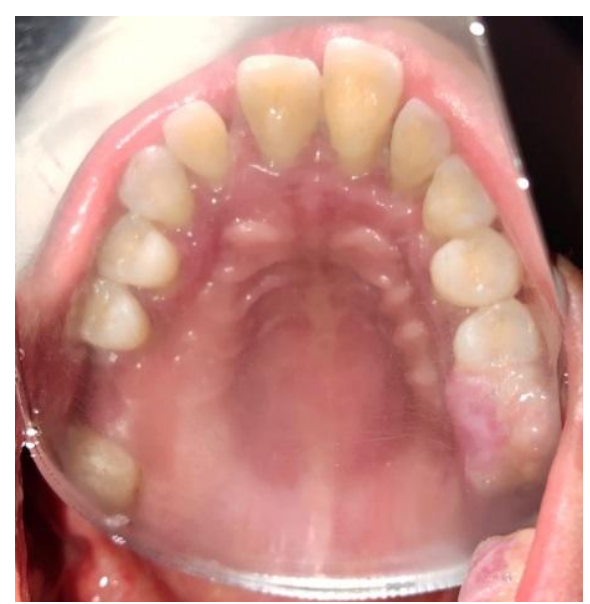
Fig-1: Intraoral photograph showing the soft tissue lesion in the edentulous region distal to 25

On radiographic examination, the intraoral periapical radiograph showed superficial erosion of the bone with pathognomonic peripheral 'cuffing' (Figure 2). Based on clinical examination, a differential diagnosis of oral fibroma, peripheral ossifying fibroma and pyogenic granuloma was established.