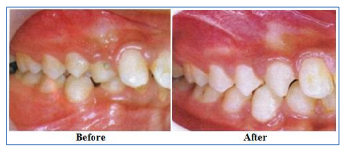
Fig-3: Intra- Oral View Before and After Treatment