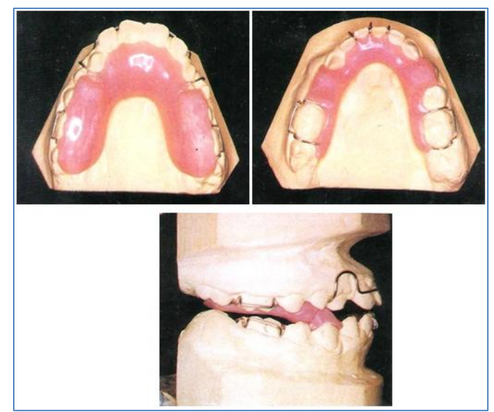
Fig-2: Upper and Lower Parts of Twin-block appliance