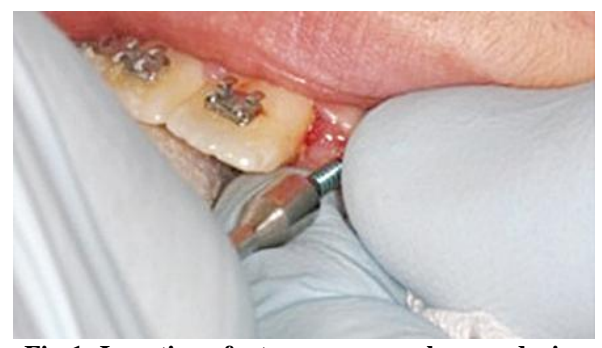
Fig-1: Insertion of a temporary anchorage device into alveolus with a manual driver for pontic support

produce the space for their threads by compression or cutting as they are inserted) [13].