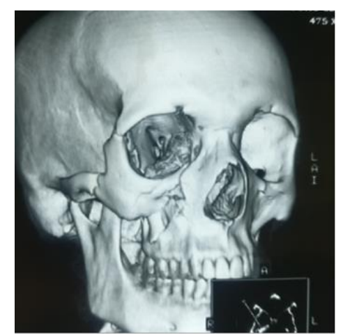
Fig-5: 3-D CT showing Fracture of Maxilla and Zygoma

In this study, the maxillofacial injuries were most common in 41-60 years and followed by 21-40 years age group accounting for 36% and 30% of total cases respectively. The injuries were found to be overwhelmingly common in male population (77 % of cases) compared to females (23%) similar study in that male predominance of facial trauma was noted