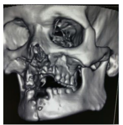
Fig-2: 3-D CT showing Fracture of Mandible and maxilla

Fig-1: 3-D CT showing Fracture of Mandible