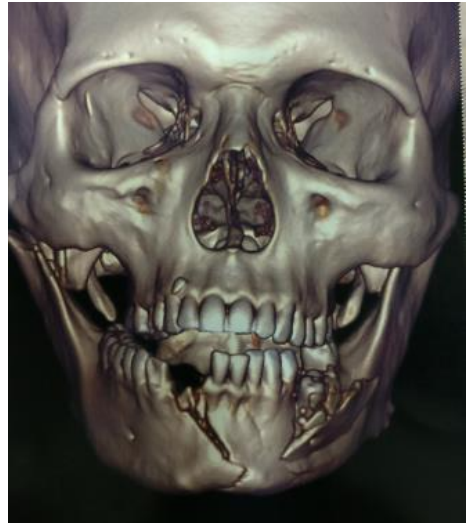
Fig-3: 3-D CT showing Fracture of Multiple Fracture of Mandible