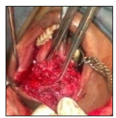
Fig-3: excision of lesion along with normal muscle

hypotensive anesthesia. Submandibular incisions were placed bilaterally with a submental extension. Skin, subcutaneous tissue, superficial fascia, platysma and deep fascia are reflected and facial arteries were identified and ligated bilaterally. Swelling was approached both intraorally and extraorally. On the contrary to the expectation, we did not encounter any blood filled tissue except, a mass of connective tissue which was excised with a margin of normal muscle (Figure.3). The wound was closed in layers and postoperative course was uneventful.