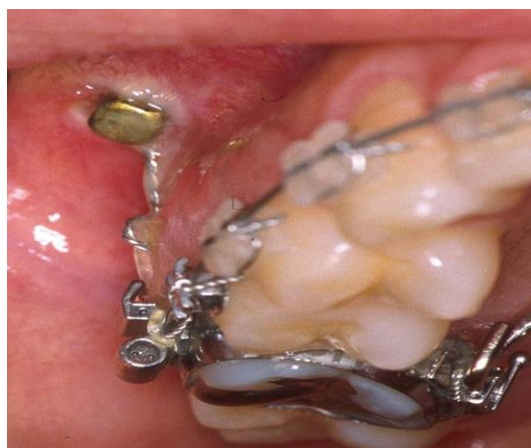
Fig-2: A screw through non-keratinized oral mucosa. Slight inflammation was shown around the screw head

The screw head placed close to the mucogingival junction irritates the movable mucosa and it becomes cause of ulcer. Auxiliaries attached between the screw head and the archwire, i.e. coil springs, elastomeric chains, hooks, and ligation wires, should be adjusted not to touch the gingiva or oral mucosa to avoid the pain and discomfort a patient. A palatal miniscrew sometimes induces pain and injury on the surface of tongue. Use of miniscrews makes it possible to distalize the whole dentition, which breaks the methodological limitation of tooth movement. However; an excessive distal movement causes impaction of the second molar under the gingiva and evokes peri-coronitis, especially in the mandible. Proper diagnosis based on the clinical examinations is important in the implant-anchored orthodontics.