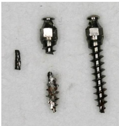
Fig-5: A screw fractured at the removal. After the fracture, the tip of screw was carefully removed with a flap surgery

4.56 +/- -1.65 N cm (-1.74 N cm to -8.95 N cm). The removal torque showed no statistical significances between gender, screw length, screw diameter, jaw type, placement sites, and retention period. The breaking points of miniscrews used in the study was at least 20 N cm, therefore, the screws could be basically removed without fracture. However, screw fracture happens when osseointegration is completed (Fig.5).