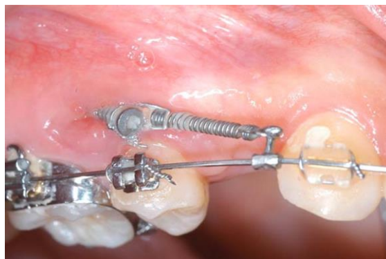
Fig-1: A screw failed during loading. Slight inflammation was shown around the screw

according to its proximity to the adjacent root; category I, the screw was absolutely separate from the root; category II, the apex of the screw appeared to touch the lamina dura; and category III, the body of the screw was overlaid on the lamina dura. Category I and II showed high success rates of 92.9% and 87.2%, respectively, but category III showed 62.5%. This tendency was more obviously demonstrated in the mandible. Several reports recently indicated same conclusion by using a three-dimensional computed tomography [34, 35].