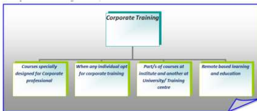
Fig: 2-Depicted types of corporate training and way to offer knowledge clusters