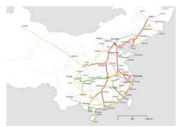
Fig-1: Four vertical and four horizontal rail strategy

10 Years, with the rapid development of high-speed rail in China. Trains operating on the economic, social and cultural life of our country and other areas have had a significant impact; study high-speed rail generated by the positive and negative effects to better guide the construction of high-speed rail has great practical significance.