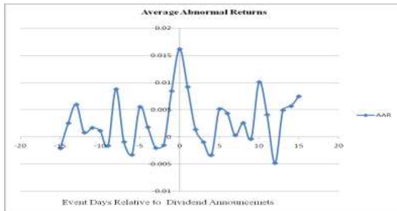
Fig-2: Average Abnormal Returns during the 31 day event window