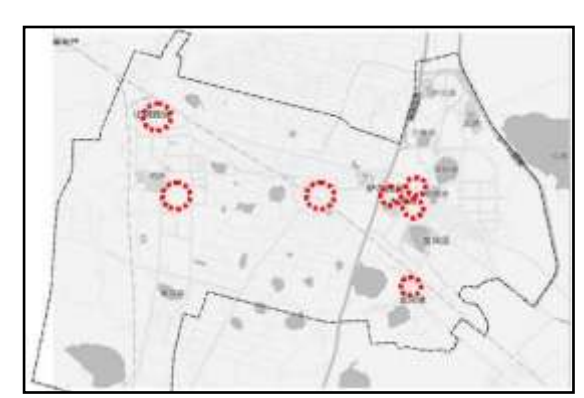
Fig-1:Distribution of business center in Daqing City

investment being settled, the former urban commercial layout which is single, low-end, lack of large projects, less big brands and irrational distribution is rapidly replaced by new and modern business pattern. Therefore, local commerce entered "multi business time" in Daqing [1]. There is indoor or outdoor Pedestrian Street in the street planning of Wanda Plaza and Lenovo technology city; other existing commercial areas are people and cars' mixed traffic mode.