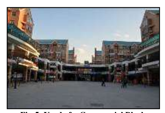
Fig-5: Yard of a Commercial Block

Although the main entrance of the building has a distribution center, parking space is designed around most commercial blocks at the same time, which results in seriously mixed people and cars, and a poor shopping environment. As Fig-4 shows, there are outdoor pedestrian streets in a few blocks, where people and cars can be diverse, so shopping atmosphere can be formed well.