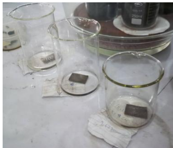
Fig-1: Steel bar Specimens

The 1500mm x 20mm (flat steel bar) was cut into 50mm x 19.5mm for ease of experiment, producing 25 sets of coupon. This was achieved by clamping the 1500mm x 20mm flat steel bar into a vice and then using hacksaw to cut the desired dimensions. After which a hole of 4mm diameter was drilled on each coupon using an electrically operated drilling machine with 4mm diameter drilling bit. The drilled hole is to aid the suspension of the coupons in different acidic environment using nylon thread. No further preparation or treatment was given to the coupon except being washed in distilled water as shown in figure 1 below.