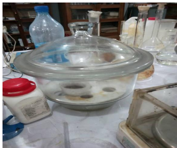
Fig-2: Experimental Set up

After preparing the various stock solutions, fifty (50) sets of clean beakers were tagged with the name of the various acids, with CW, denoting cold worked specimen. Each of five (5) corrosion environment having ten (10) beakers each, five of which is for cold worked specimen, with various concentration ranging from 0.5M to 2.5M. Prior to immersion, the approximate pH value of each solution was taken, using a pH meter, and the value recorded. The specimens were properly washed with distilled water, dried with clean piece of cloth, and then the initial weight was taken, using the Meter PM II Sensitive Digital weigh balance, and then recorded. Total immersion in 200ml test solution of the specimens into the various environment, was aided with the use of a nylon rope tied to a clean to a clean flattened steel rod of about 3mm diameter, placed on top of each beaker, for support as shown in figure 2 below.