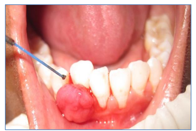
Fig-2: Excision of the lesion with laser

The laser device is classified as Class 4 laser system, especially designed safety glasses were provided to the patient, operator, and dental assistant for protection of the eyes from the laser beam. Oral hygiene instructions were reinforced after the treatment. An elliptical incision was made around the peduncle, and then the lesion was lifted along with the underlying periosteum from the bone surface and removed until soft tissue were eliminated.