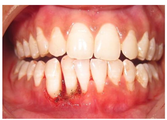
Fig-4: Immediate post- operative view