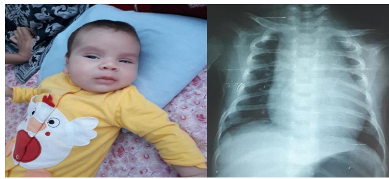
Patient n° 5 at diagnosis (2 months)