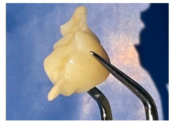
Figure 5: Lithium disilicate glass ceramic inlay-retained fixed dental prosthesis (IRFDPs)

Before cementation, the restoration were evaluated in terms of fit, integrity, marginal adaptation, occlusion and esthetics (Fig 6). The using of try in paste had led to the choice of a transparent dual-cure resin cement color (Variolink®N intro pack).