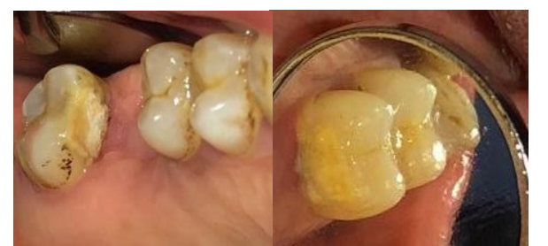
Figure 1: The proximal provisional restorations: (a) The Maxillary second molar; (b) The Maxillary second premolar

The clinical examination revealed proximal provisional restorations adjacent to the missing tooth (fig 1) with a healthy periodontal tissues. The patient oral hygiene was acceptable.