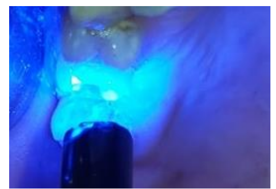
Figure 3: The light polymerization of the adhesive for the immediate dentin sealing (IDS)

After that, the impression was taken using condensation silicone (Protesil® putty base and catalyst, light base) with the simultaneous double mixing technique and then sent to the laboratory. In advance, gingival retraction cord was used to obtain a better emergence profile. For the mandibular arch, an irreversible hydrocolloid (Cavex CA 37®) was used.