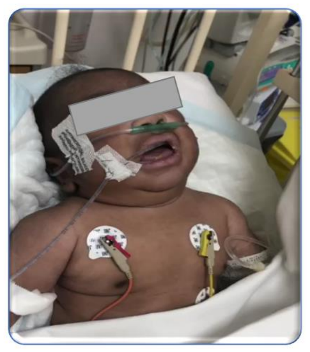
Fig 1: Patient at time of admission

We treated him as obstructive lung disease with frequent salbutamol nebulization and magnesium sulfate (MGSO4). We tried Non-Invasive Ventilation (NIV) and patient connected to BIPAP with IPAP (inspiratory airway pressure) 15 and EPAP (expiratory airway pressure) 8 with FIO2 100% and x ray chest as well as ECHO requested, (Fig 1).