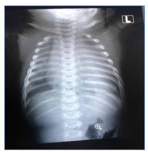
Fig 2: X ray at admission

Twelve-leads electrocardiography (ECG) showed sinus rhythm, right-axis deviation, a tall P wave in the II-lead, and positive T waves in leads V1 to V3, (Fig 2).