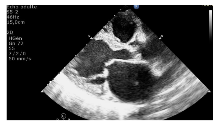
Figure 1: Abnormally thickened mitral valve leaflets in parasternal long-axis view on transthoracic echocardiography

Transthorasic echocardiography revealed calcified, thickened valve leaflets (Fig 1) and restricted diastolic opening, with severe mitral stenosis and a mitral valve area of 0,8 cm2 by planimetry and a mean pressure gradient of 13 mmHg associated with a moderate mitral regurgitation with a proximal isovelocity surface area (PISA) of 7 mm.