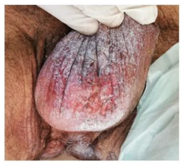
Fig-1: Early patches of gangrene

serum potassium) (figure 5). He was discharged on the 8^{th} hospital day under ceftriaxone and metronidazole for three weeks.