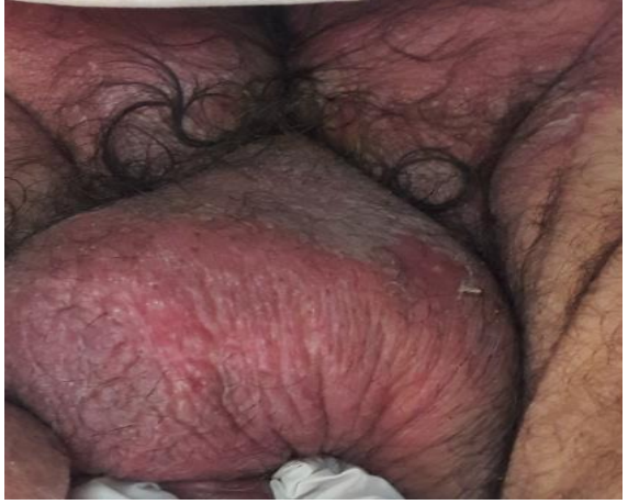
Fig-3: Regression of cutaneous infiltration