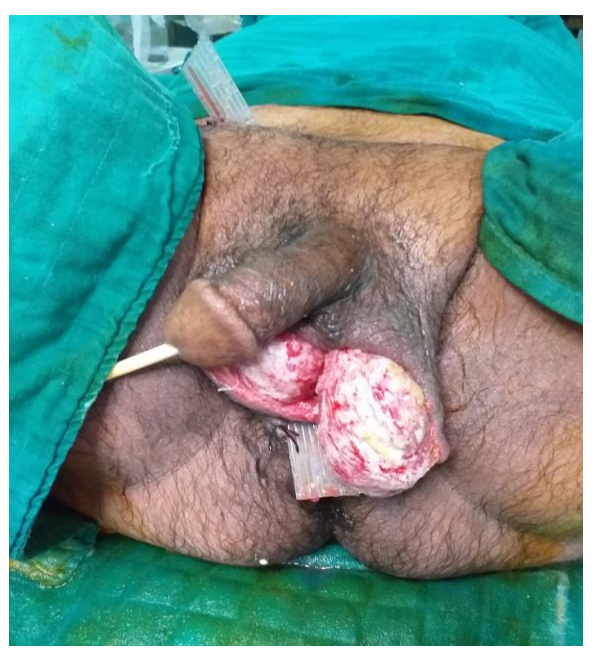
Figure 3: Post-operative image