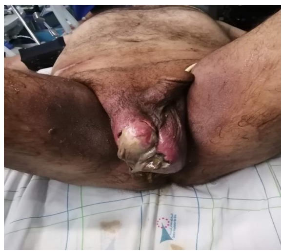
Figure 1: Testicle with necrotic appearance

The collection was 14.8 cm long and 5 cm wide with an abdominal parietal opening in the right iliac fossa opposite an infiltrated digestive loop. This collection leaked subcutaneously in the inguinal and scrotal region, resulting in bilateral testicular gangrene.