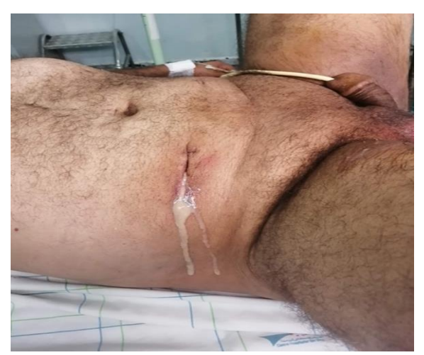
Figure 2: Parietal infection