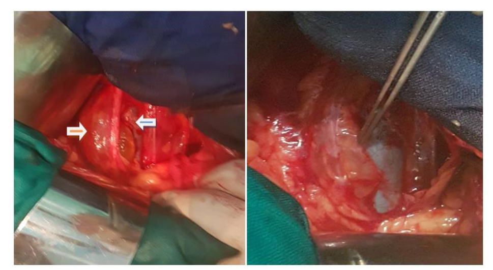
Figure 2: Intraoperative image showing the cystic lymphangioma (orange arrow) adhering to the inferior vena cava (blue arrow)