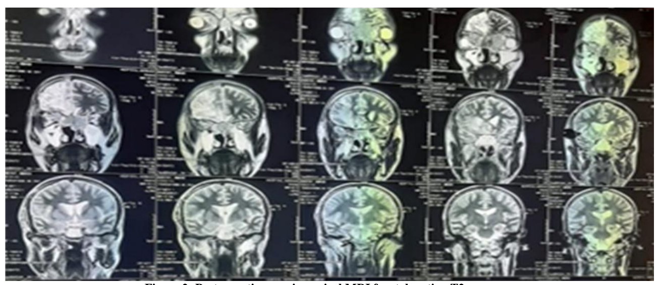
Figure 2: Postoperative craniocervical MRI frontal section T2 sequence

A postoperative MRI revealed the persistence of the ethmoidofrontal process with orbital and endocranial extension measuring 5x6cm.