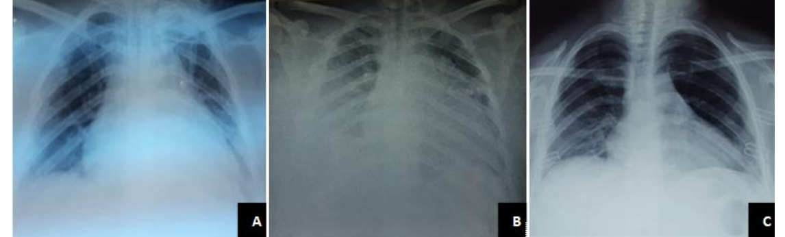
Figure 4: The course of mediastinitis through chest X-rays: A) Mediastinal enlargement with left pleural effusion on admission B) Bilateral pleural on day 10 C) Normal X-ray before ICU discharge on day 20