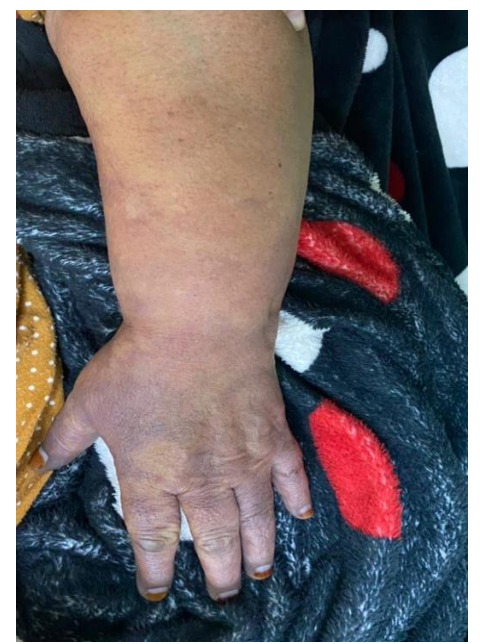
Figure 1: This photo is an objective view of our patient's ischemic left upper limb

In addition, a cold and cyanotic left upper limb with abolition of radial and ulnar pulses and a skin recoloration time exceeding 3 seconds was noted.