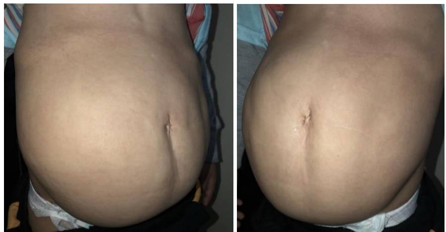
Figure 1: Clinical picture of the infant showing abdominal distension with thin and slightly wrinkled appearance of the abdominal wall

was consistent with PBS. No clinical or radiological evidence for any known associated congenital anomalies was found.