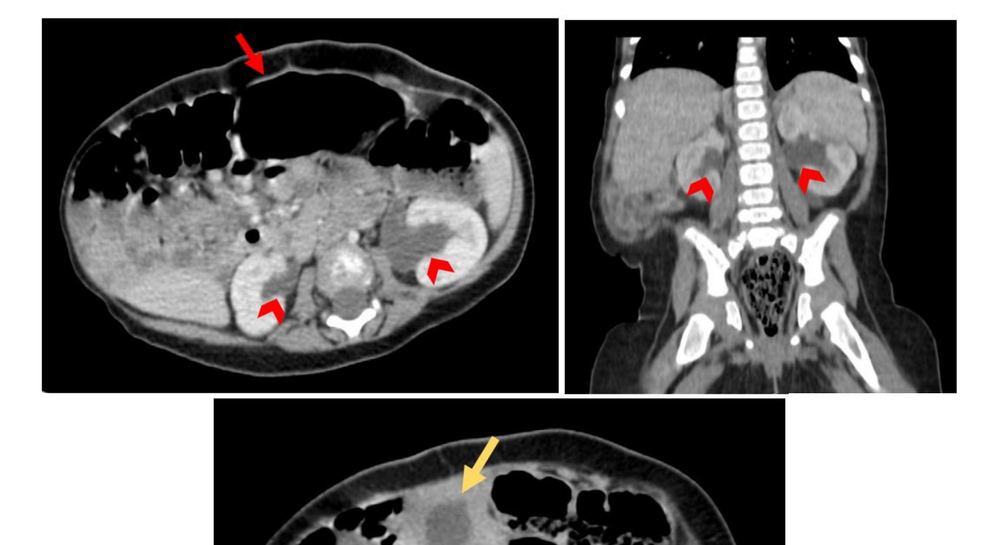
Figure 4: Abdominal CT-scan revealing aplasia of the muscles of the anterior abdominal wall (red arrow), major bilateral ureterohydronephrosis (red head arrows), associated with thickened bladder wall (yellow arrow)

© 2023 Scholars Journal of Medical Case Reports | Published by SAS Publishers, India