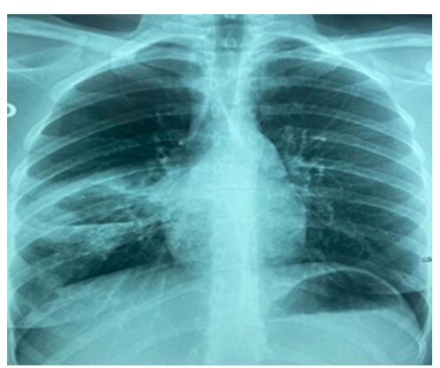
Figure 1: Image of a tubercular cavern (starting point for multifocal TB)

tuberculosis treatment combined with 2 months' oral corticosteroid therapy, with a good clinical, biological and radiological evolution in 85% of our series, with a single death after 8 months of evolution, and an infant who progressed to chronic respiratory failure.