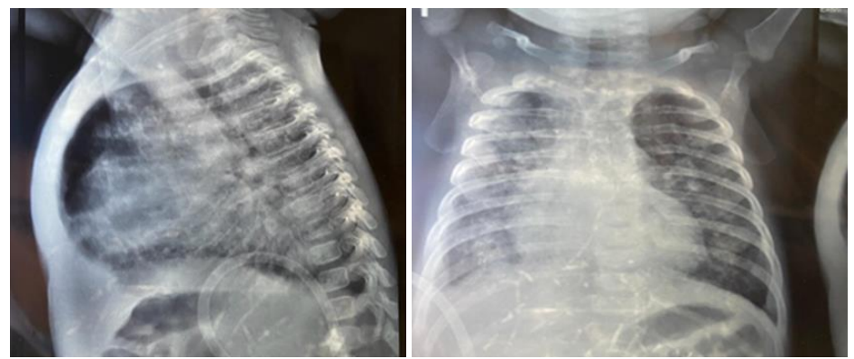
Figure 2: Chest X-ray image of tuberculous miliaria, front and side