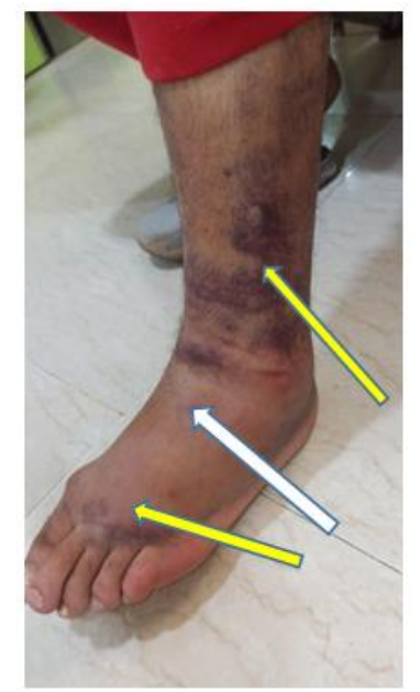
Figure n°1: Clinical image patient's injured lower limb on admission; yellow arrows showing ecchymosis and white arrow showing oedema

X-rays of the left ankle revealed a simple oblique, non-displaced fracture of the medial region of the tibial pilon, type 1 of the Ruedi and Allgower classification, and a transverse, non-displaced fracture of the lateral malleolus (Figure n° 2: A and B). A CT scan of the injured ankle confirmed the diagnosis, showing in greater detail the fracture of the tibial pilon and lateral malleolus (Figure n° 3: A, B, C and D).