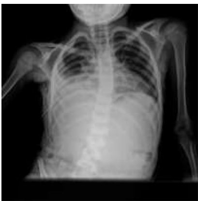
Fig. 2: PA scan showing pneumonic infiltration