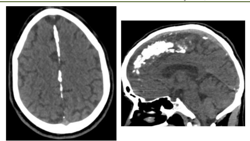
Figure 2: Cerebral CT scan in axial and sagital view showing calcification in falx cerebri