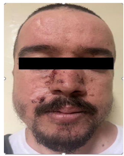
Figure 1: Face of the patient with frontal prominences and numerous facial nodes

We had foor major criteria thus the diagnostic of Gorlin-Goltz syndrome was established.