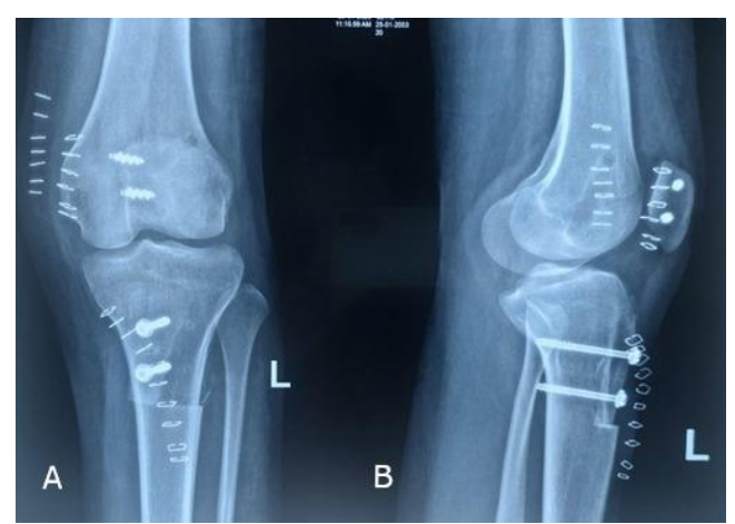
Figure 3: Post-operative X-ray left knee AP view (A) & Lateral view (B)