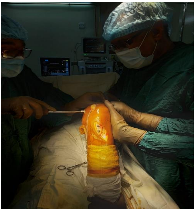
Figure 7: Screw fixation