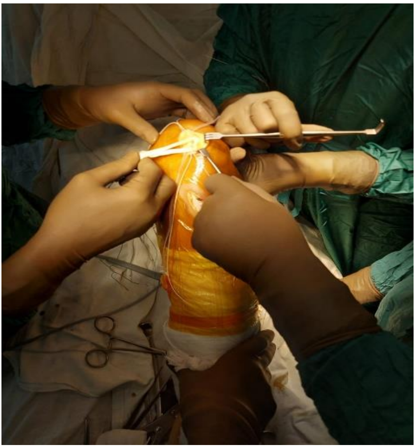
Figure 5: Keeping the knee joint bent in a 45° angle & tightness of the lateral retinaculum was maintained after MPFL reconstruction