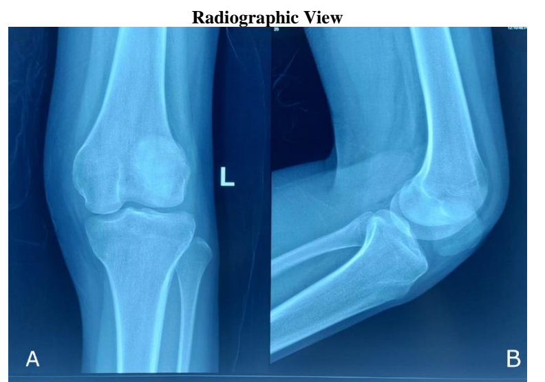
Figure 1: Pre-operative X-ray left knee AP view (A) & Lateral view (B)