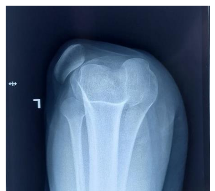
Figure 2: Pre-operative X-ray left knee skyline view showing patella tilted laterally