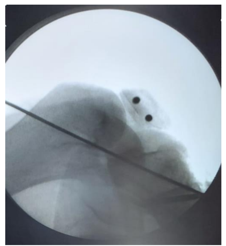
Figure 6: Femoral attachment site under fluoroscopy, marked the isometric point